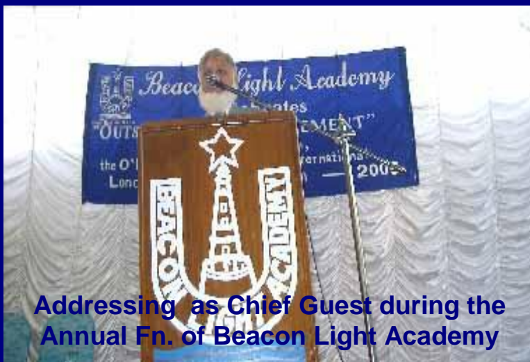
Addressing as Chief Guest during the Annual Fn. of Beacon Light Academy