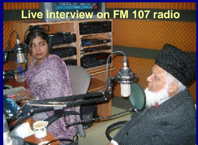
Live interview on FM 107 radio