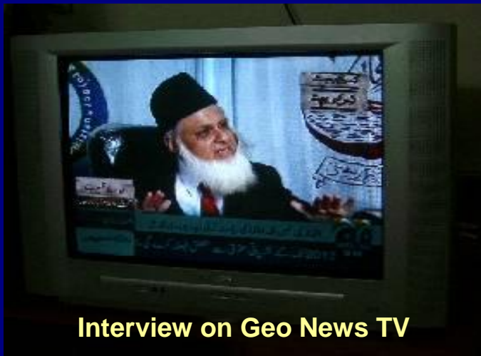
Interview on Geo News TV