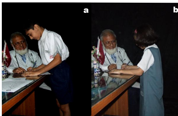
Fig. NGDS-2a, b. Under-11 children reporting in school uniform; girl's hair open, held only by hairband

11+ Children: Athletic kit OR T-shirt, trousers (boys); shalwaar kameez (girls)