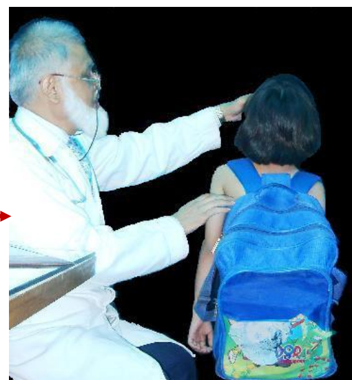
Fig. NGDS-3. Proper wearing of school bag