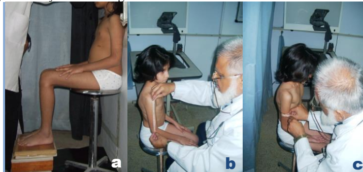
Fig. 1a-c. Illustrating (a) positioning of feet on wooden planks, (b) determining separation of acromial and radial landmarks as well as (c) measuring MUAC at the midpoint of acromial and radial landmarks

Conclusion: Results of this study indicated that MUAC of children measured lie in the category of nourished. The formula is applicable only if one layer of clothing of uniform thickness is worn.