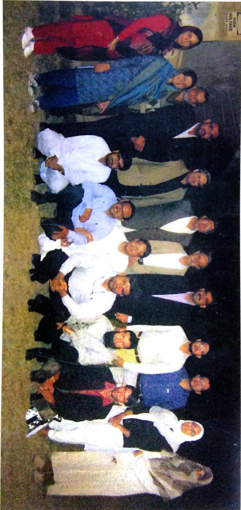
FIRST BATCH OF M.S PHYSICS (2009) WITH TEACHERS