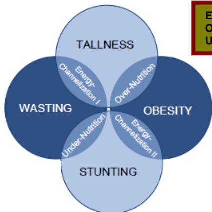
Fig. 1. Venn-diagrammatic (set-theoretic) representation of EC, ON and UN

EC: Energy-Channelization ON: Over-Nutrition UN: Under-Nutrition