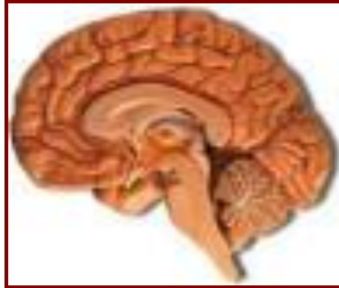
Fig. 1. The human brain

Global-electrocortical activity of the human brain (Fig. 1) was modeled as a system of damped-coupled-harmonic oscillators. The equations were written in a covariant form using tensorial