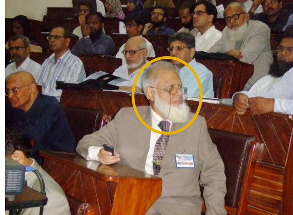
Fig. 1. Introducing 'astromathematics' during an invited lecture delivered in 2012