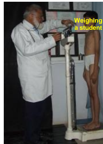
Fig. 2. Weighing a student in Growth Laboratory